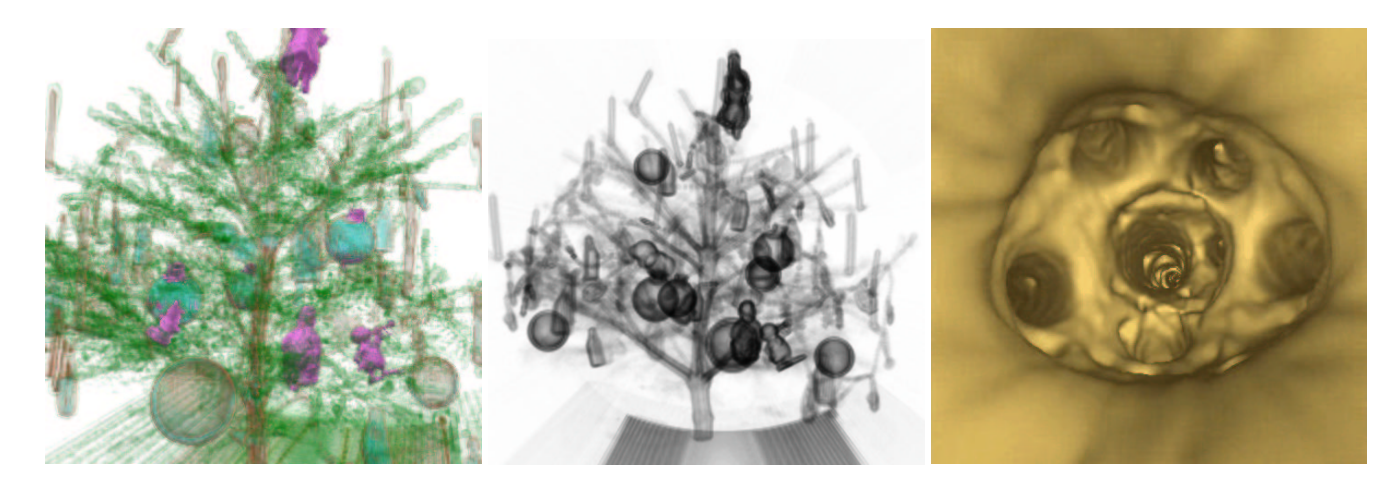
Figure 4: From left to right: Interactive wavelet encoded multiresolution volume rendering. Non-photorealistic rendering using the "Bubble Model". View of a seven-fold branch in a virtual arboroscopy.