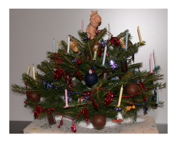
Figure 2: A picture of the Christmas tree.

Segmentation of tomographic data sets is traditionally depending on the goals, either very simple or very complicated. The simple task in our case was classification of the foreground voxels (the tree itself with decorations) with respect to the background. This task was accomplished easily by thresholding. The hard segmentation task was to separate various tissues of the tree (trunk and needles) and decorations. For this purpose we used two segmentation tools, ISEG [9] and the segmentation functionality of JVision (a medical 3D workstation from TIANI MedGraph [13]). ISEG is a general purpose interactive system for segmentation of 3D data sets based on the assumption of spatial object homogeneity. Such